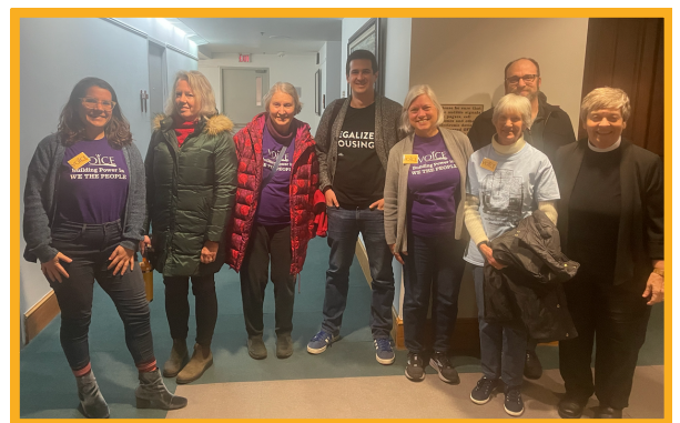
VOICE Leaders at 1am after the Alexandria City Council Meeting