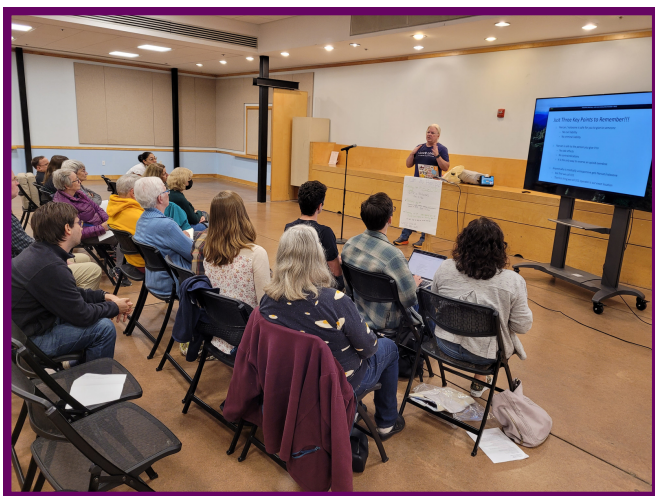
Arlington Narcan Training.

In the wake of two overdose deaths (and two additional near-deaths) by teens at Wakefield High School, VOICE took aim at the youth overdose crisis and in Arlington we recently secured $750,000 in county funding to stand up new after-school programs so that the most vulnerable students in our community have safe and supportive places to go during after-school, and potentially summer, hours. We are also working to get members of our community, especially Spanish-speaking parents, trained to administer the life-saving nasal spray, Narcan, which can reverse an overdose.