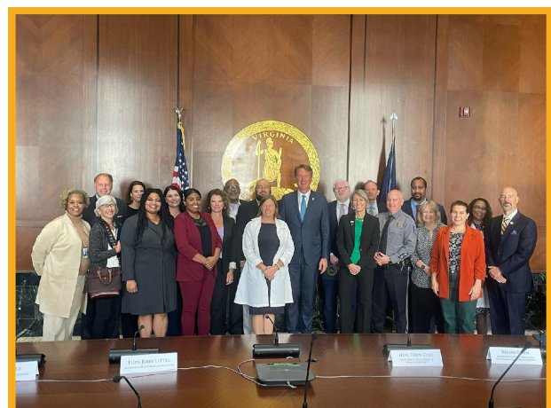
Meeting with the governor to deliver our behavior health policy recommendations