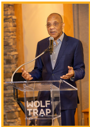
Washington Post columnist Eugene Robinson

As we reflected on where we have been, the world as it is now, and the future we are working together to create we also turned our attention to organizing money to support the work we have ahead of us. Through the generous support of the Gala sponsors and individual leader's donations, we raised an incredible $40,000!