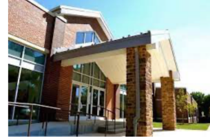
Mt. Olive Baptist Church a founding member