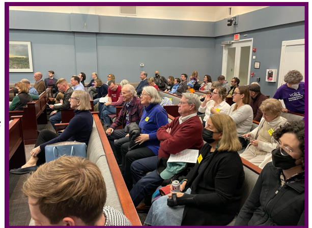
VOICE Leaders, March 22nd at the Arlington County Board Meeting

Following Organizing efforts in Arlington, VOICE and our allies secured a major victory in Alexandria: the unanimous passage of the Zoning for Housing Initiative by the City Council. Zoning for Housing, like the Missing Middle policy in Arlington, does away with exclusionary zoning in single-family home neighborhoods, instead allowing a broader diversity of housing types such as duplexes, townhomes, quads, and sixplexes on the same site. It also clarified and simplified zoning rules around multifamily housing and other zoning areas that could generate thousands of new affordable housing units in the coming years!