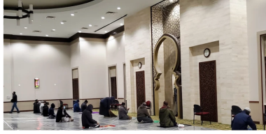
All Dulles Area Muslim Society