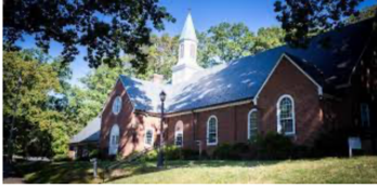
Trinity Presbyterian Church (Arlington) – Joined 2021