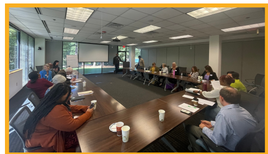
Working with our allies in the Hospital Association and community members to provide behavioral health policy recommendations to Gov. Youngkin's office.